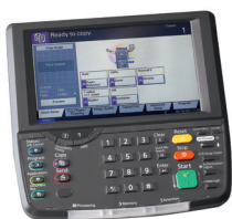
Newly designed, easy-to-use large color touch screen control panel