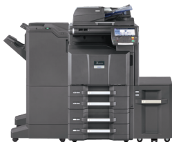
Shown with optional 175 sheet DSDP, 500 x 2 sheet paper trays, 3,000 sheet side LCT and 4,000 sheet finisher