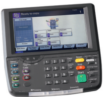
Newly designed, easy-to-use large color touch screen control panel