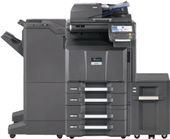
Shown with optional 175 sheet DSDP, 500 x 2 sheet paper trays, 3,000 sheet side LCT and 4,000 sheet finisher