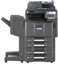
Shown with optional 175 sheet DSDP, 500 x 2 sheet paper trays and 1,000 sheet finisher