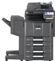
Shown with optional 175 sheet DSDP, 500 x 2 sheet paper trays and 1,000 sheet finisher